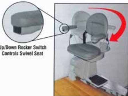
Up/Down Rocker Switch Controls Swivel Seat

(Not available with the Larger Seat Option)